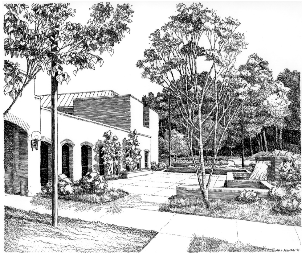
“Where Faith and Life Connect”