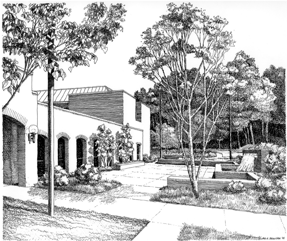
“Where Faith and Life Connect”