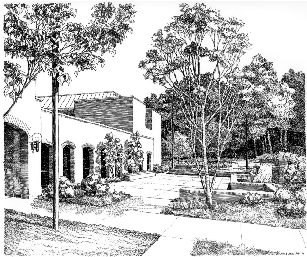
“Where Faith and Life Connect”