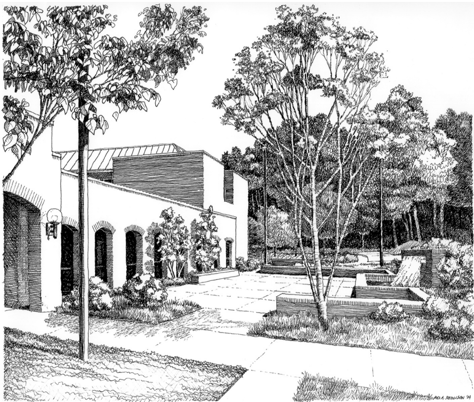
“Where Faith and Life Connect”