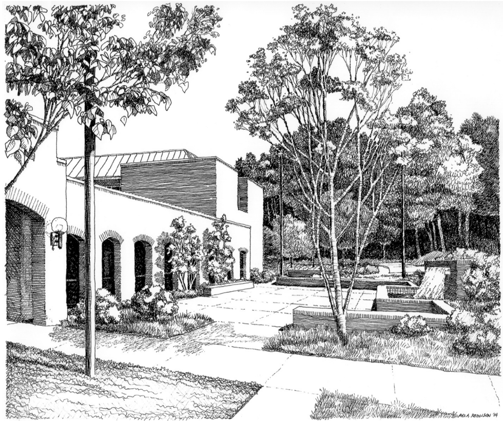
“Where Faith and Life Connect”

The Order of Worship November 25, 2018 9:00 and 11:00 A.M.