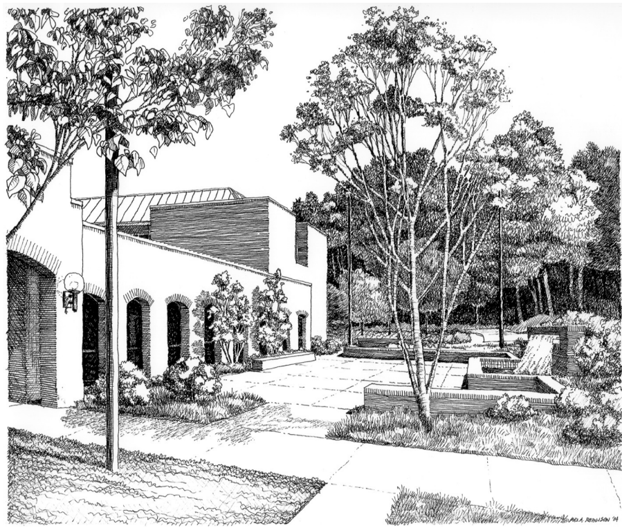
“Where Faith and Life Connect”