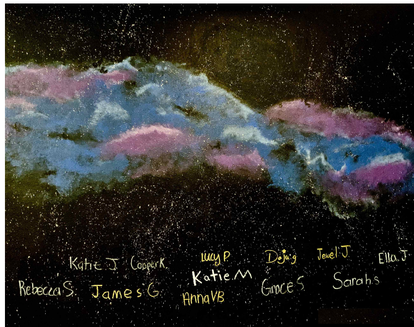
"In the beginning, God" mural painted by 2024 Confirmation Class